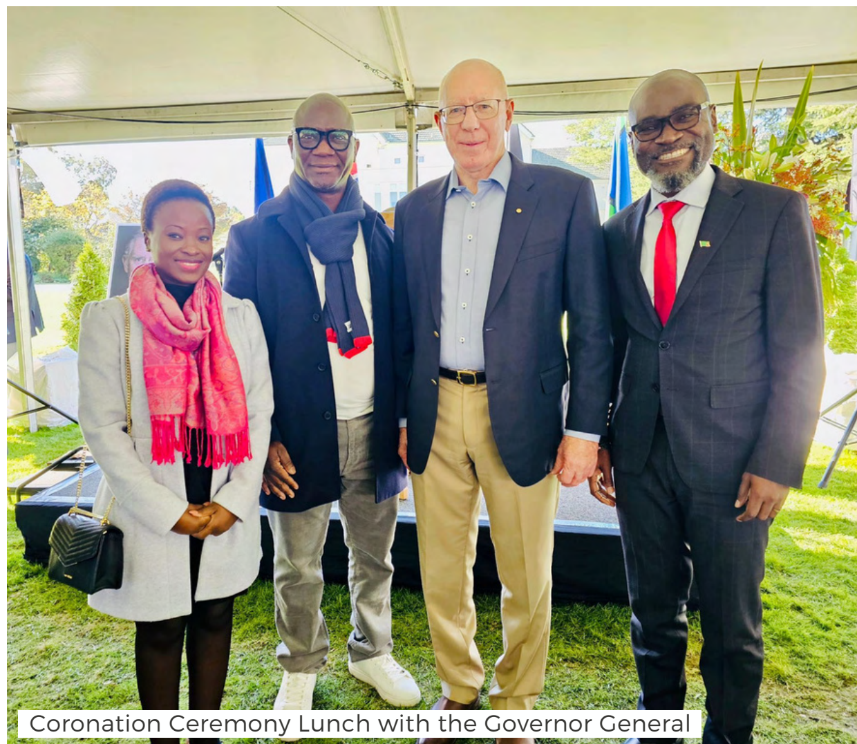
Coronation Ceremony Lunch with the Governor General